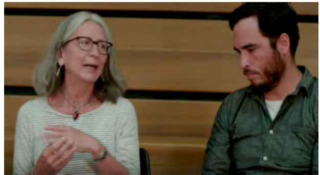
From the video "Indigenous Law: Tough Questions" by the Indigenous Law Research Unit at the University of Victoria's Faculty of Law.

During the conference deliberations on the competencies new lawyers need for practice, a number of attendees pointed to the need for a greater focus on soft skills (e.g. emotional intelligence, leadership, teamwork, resilience), professionalism, and practice management (e.g. time management, communication, stress management, business skills). This discussion of competencies raised the