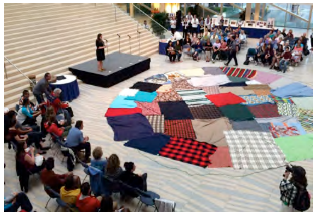
From the University of Alberta video showing the Kairos blanket exercise, part of the Foundations of Law Course of the Law Faculty.